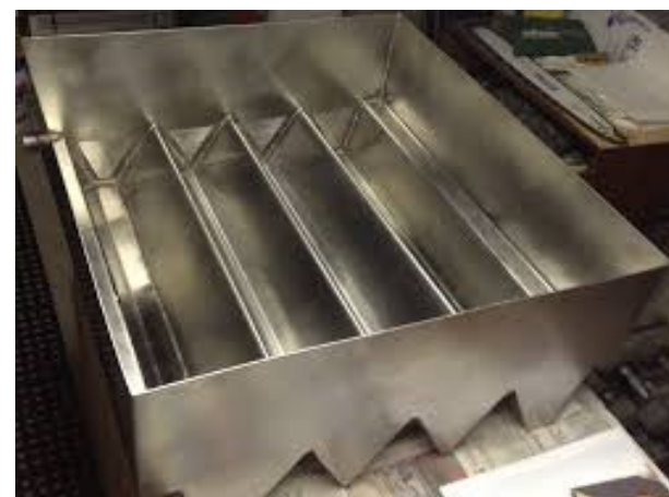
1870s - Flue Pan