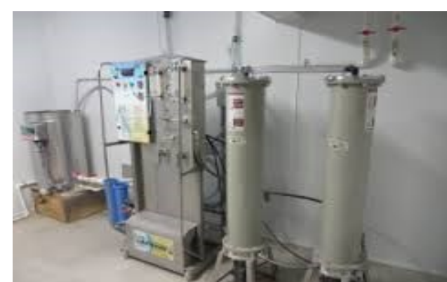
1980s - Reverse Osmosis