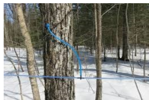
1960s - Tubing Systems