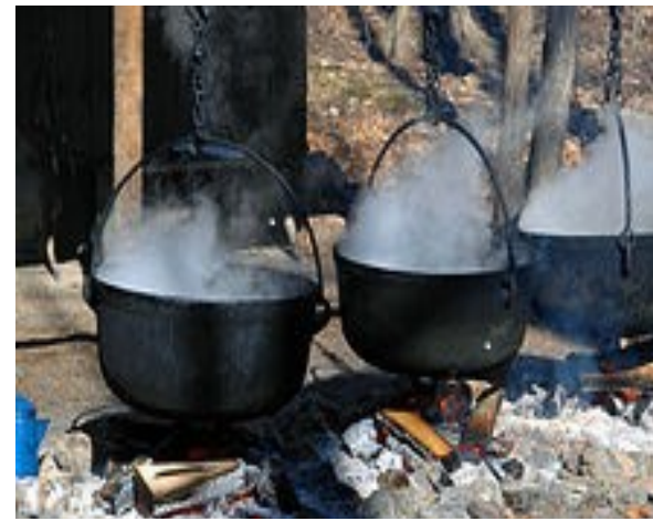
Pre 1860s - Open Fire Kettle