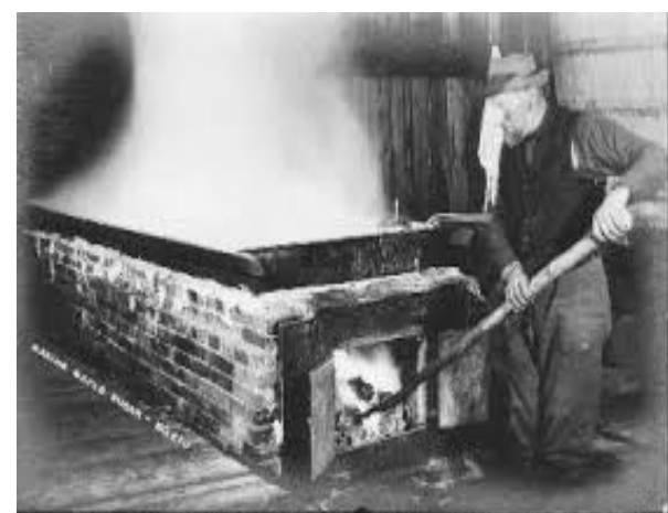
1860s - Flat Pan