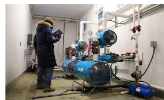
1990s - Vacuum System